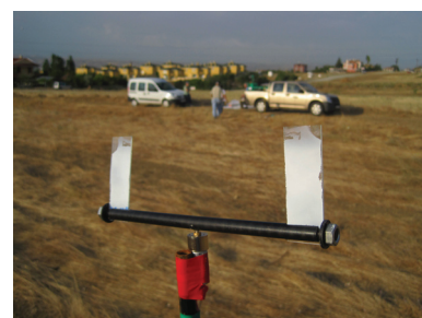
Rotating Slide Impactors