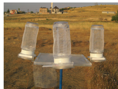
Insect Test Cages